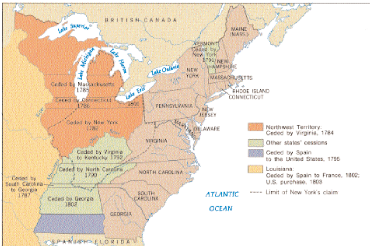
Western Land Cessions to the United States, 1782–1802

A major complaint was that the land-blessed states could sell their trans-Appalachian tracts and thus pay off pensions and other debts incurred in the common cause. States without such holdings would have to tax themselves heavily to defray these obligations. Why not turn the whole western area over to the central government?