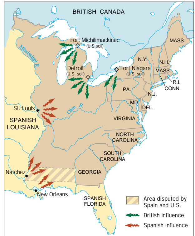
Main Centers of Spanish and British Influence After 1783 This map shows graphically that the United States in 1783 achieved complete independence in name only, particularly in the area west of the Appalachian Mountains. Not until twenty years had passed did the new Republic, with the purchase of Louisiana from France in 1803, eliminate foreign influence from the area east of the Mississippi River.

Spain, though recently an enemy of Britain, was openly unfriendly to the new Republic. It controlled the mouth of the all-important Mississippi, down