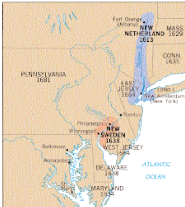
Early Settlements in the Middle Colonies, with Founding Dates

Andros was prompt to use the mailed fist. He ruthlessly curbed the cherished town meetings; laid heavy restrictions on the courts, the press, and the schools; and revoked all land titles. Dispensing with the popular assemblies, he taxed the people without the consent of their duly elected representatives. He also strove to enforce the unpopular Navigation Laws and suppress smuggling. Liberty-loving colonists, accustomed to unusual privileges during long decades of neglect, were goaded to the verge of revolt.