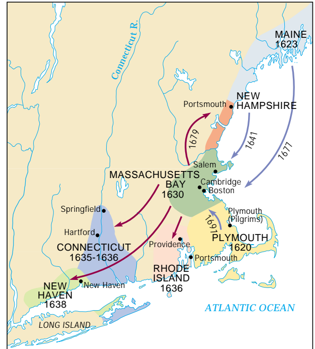
Seventeenth-Century New England Settlements

The smiling valley of the Connecticut River, one of the few highly fertile expanses of any size in all New England, had meanwhile attracted a sprinkling of Dutch and English settlers. Hartford was founded in 1635. The next year witnessed a spectacular beginning of the centuries-long westward movement across the continent. An energetic group of Boston Puritans, led by the Reverend Thomas Hooker, swarmed as a body into the Hartford area, with the ailing Mrs. Hooker carried on a horse litter.