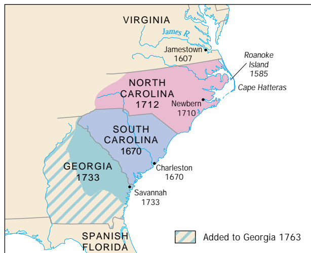
Early Carolina and Georgia Settlements

Although northern Carolina, unlike the colony's southern reaches, did not at first import large numbers of African slaves, both regions shared in the ongoing tragedy of bloody relations between Indians and Europeans. Tuscarora Indians fell upon the fledgling settlement at Newbern in 1711. The North Carolinians, aided by their heavily armed brothers from the south, retaliated by crushing the Tuscaroras in battle, selling hundreds of them into slavery and leaving the survivors to wander northward to seek the protection of the Iroquois. The Tuscaroras eventually became the Sixth Nation of the Iroquois Confederacy. In another ferocious encounter four years later, the South Carolinians defeated and dispersed the Yamasee Indians.