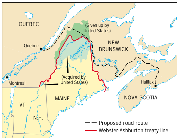
Maine Boundary Settlement, 1842

financier Lord Ashburton, who had married a wealthy American woman. He speedily established cordial relations with Secretary Webster, who had recently been lionized during a visit to Britain.