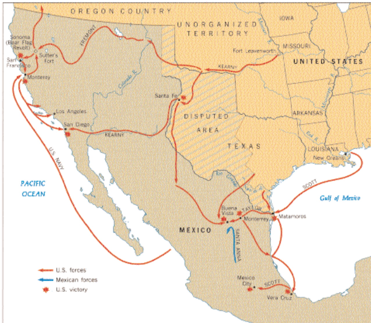
Major Campaigns of the Mexican War

upon the country by the shedding of “American blood upon the American soil.” A patriotic Congress overwhelmingly voted for war, and enthusiastic volunteers cried, “Ho for the Halls of the Montezumas!” and “Mexico or Death!” Inflamed by the war fever, even antislavery Whig bastions melted and joined with the rest of the nation, though they later condemned “Jimmy Polk’s war.” As James Russell Lowell of Massachusetts lamented,