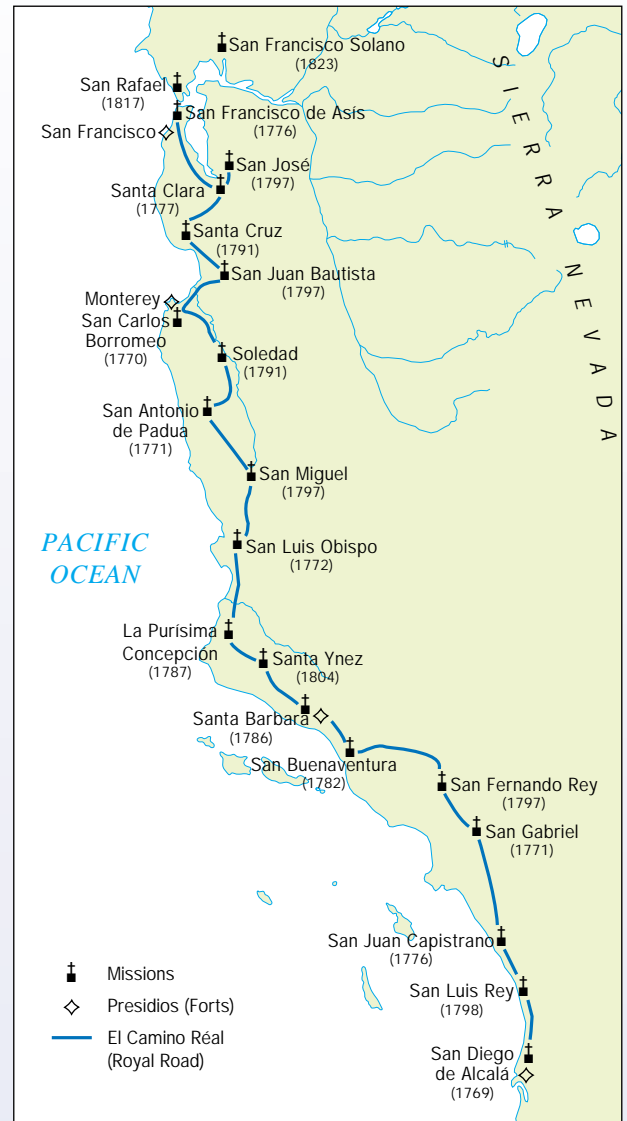
Spanish Missions and Presidios

By 1870 the Californios' brief ascendancy had utterly vanished—a short and sad tale of riches to