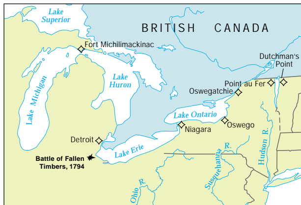
American Posts Held by the British After 1783

These actions incensed patriotic Americans. A mighty outcry arose, chiefly from Jeffersonians, that America should once again fight George III in defense of its liberties. At the very least, it should cut off all supplies to its oppressor through a nationwide embargo. But the Federalists stoutly resisted all demands for drastic action. Hamilton’s high hopes for economic development depended on trade with Britain. War with the world’s mightiest commercial empire would pierce the heart of the Hamiltonian financial system.